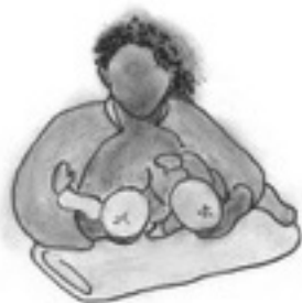
Double-Football with twins