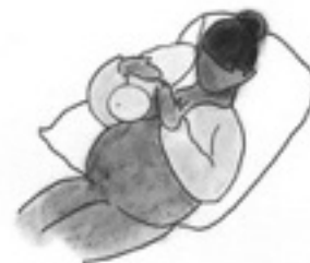
Over-the-shoulder hold for during or after a Cesarean Delivery